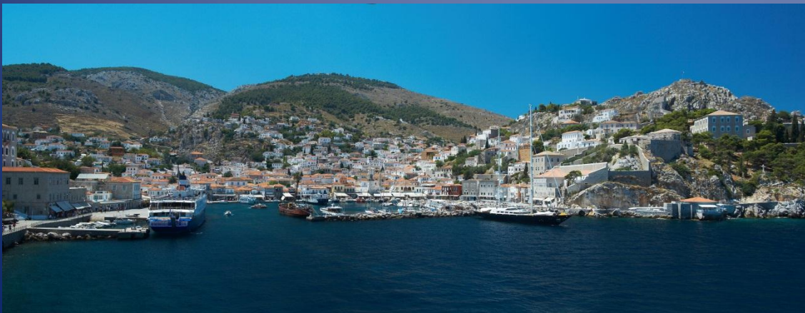
Port of Hydra

The beaches are suitable for swimming and several of them have blue flag. With regard to the economy of the region most inhabitants are engaged in agriculture.